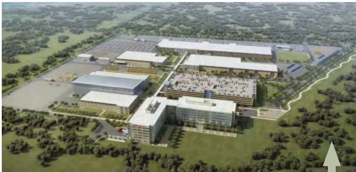
Figure 1: Project Greenfield, Phase I (as pictured in this aerial rendering) demonstrates that a COBie-based building information exchange can be successfully implemented across a broad range of facility types.